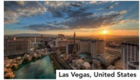
Las Vegas, United States

You can get a taxi easily. You can't get a taxi easily. You should visit in the summer. You shouldn't visit in the summer.