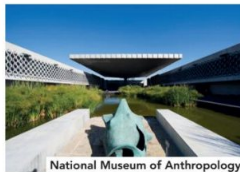
National Museum of Anthropology

CLAUDIA You can't miss the street food. The tacos, barbecue, fruit . . . it's all delicious.