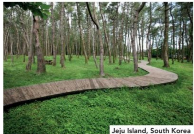
Jeju Island, South Korea

What's the best time of year to visit? What's the weather like then? What should tourists see and do there? What special foods can you eat? What's the shopping like? What things should people buy? What else can visitors do there?