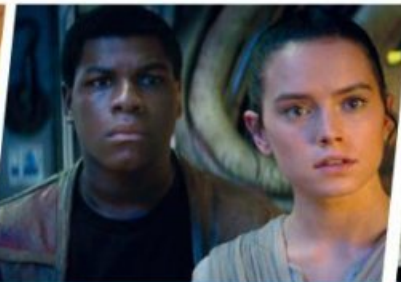
Star Wars: The Force Awakens