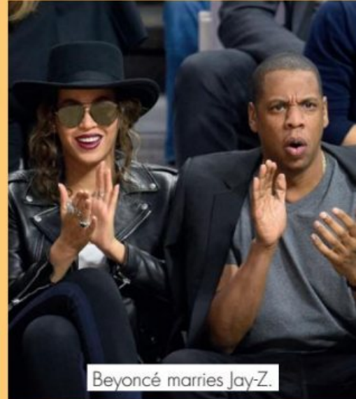
Beyoncé marries Jay-Z.