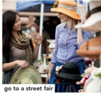
go to a street fair