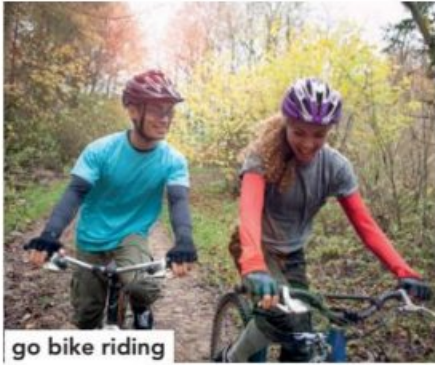
go bike riding