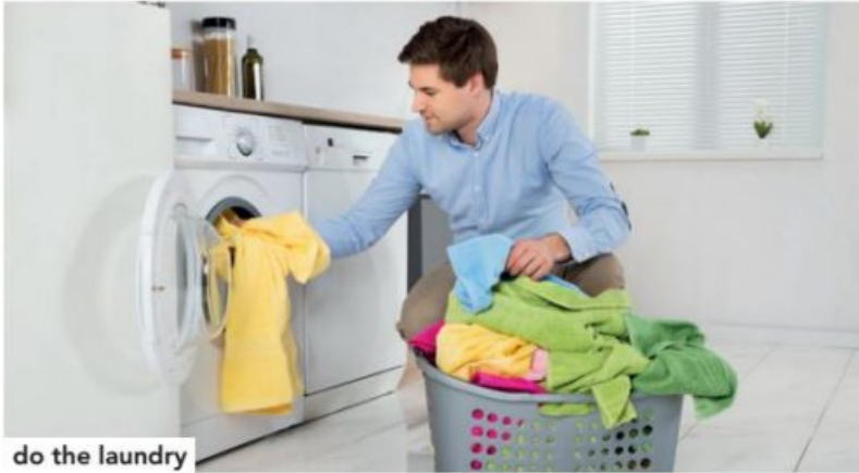
do the laundry