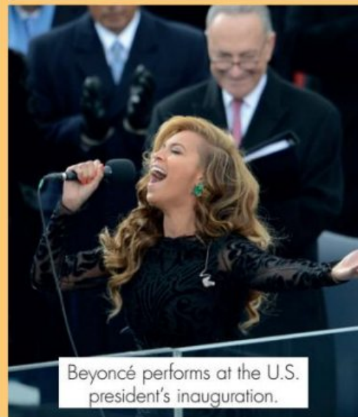
Beyoncé performs at the U.S. president's inauguration.

B Read the article. Then number these sentences from 1 (first event) to 8 (last event).