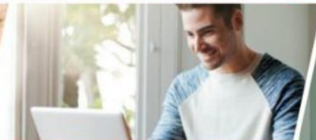
social media assistant