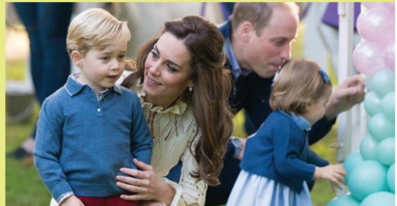
Bruno Mars, Leonardo di Caprio, Liam Hemsworth, January Jones, Angelina Jolie, Audrey Hepburn

B Read the article. Then check (✓) the sentences that are true.