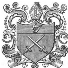
Arms of the Bishoprick.

This diocese is one of the ten that constitute the province of Armagh: it is partly in the counties of Antrim and Donegal, but chiefly in Tyrone and Londonderry, extending 47 miles in length by 43 in breadth, and comprehending an estimated superficies of 659,000 acres, of which 2500 are in Antrim, 139,300 in Donegal, 233,100 in Tyrone, and 284,100 in Londonderry. The lands belonging to the see comprise 77,102 statute acres, of which 39,621 are profitable land, and 37,481 unprofitable; and the gross yearly revenue derived from these lands and from appropriate tithes, on an average of three years ending Dec. 31st, 1831, amounted to £14,193. 3. 9½. Under the Church Temporalities act an annual charge of £4160 is, from 1834, payable out of the see estates to the funds of the Ecclesiastical Commissioners: this payment is made to diminish the excess of the revenue