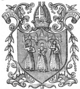
Arms of the Archbishoprick.