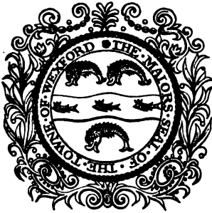
Seal of the Corporation.