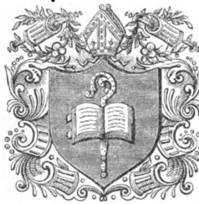
Arms of the Bishoprick.

The episcopal SEE of KILLALA appears to have been founded between the years 434 and 441, by St. Patrick, who, during that period, was propagating the faith of Christianity in the province of Connaught; and built a church at this place, called Kill-Aladh, over which he placed one of his disciples, St. Muredach, as bishop. Of Muredach's successors, who by early writers are called bishops of Tiramalgaid (from the surrounding territory, now the barony