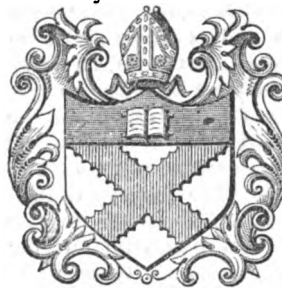
Arms of the Bishoprick.