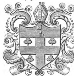
Arms of the Bishopric.

The SEE of KILLALOE was originally founded about 639, by Pope John IV., who consecrated St. Flannan, successor to St. Lua or Molua, first bishop. Theodorick, King of Munster and father of St. Flannan, endowed the see with many estates, and was interred in the abbey. Moriartach, King of Ireland, and Donald O'Brien, King of Limerick, were also great benefactors; and the former was interred here with