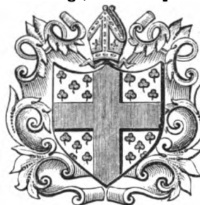
Arms of the Bishoprick.