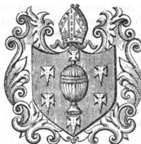
Arms of the Bishoprick.

criminal jurisdiction within the county of the city; and a court of record, called the Tholsel, for the determination of actions to any amount exceeding £20, every Tuesday and Friday. Assizes for the county of the city, and for the county at large, are held here twice in the year; and quarter sessions for the county of Kilkenny are held in rotation with the towns of Castlecomer, Thomastown, and Urlingford. A peace preservation force is stationed in the city, the expense of maintaining which, for 1835, amounted to £712. 15. 10. The court-house, called Grace's Old Castle, contains courts both for the city and for the county at large, and is a spacious and handsome modern building, occupying part of the site of the ancient castle of the family of Grace, of whom William Grace, or Le Gras, its first founder, was seneschal of Leinster and governor of Kilkenny. The city gaol is a badly constructed edifice, containing seven cells, but not adapted to the classification of prisoners. The county gaol is a spacious modern building of stone, a little to the west of the city: it contains 48 cells, is well arranged for classification, and has a tread-mill and a well-conducted school.