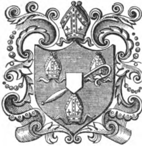
Arms of the Bishopric.

delight and animation. The English language is spoken throughout every part of the county, and the peasantry in some of the districts possess an originality nowhere else found in Ireland, particularly in the plains stretching from the boundary of Kildare near Maynooth, by Ratoath, Duleek, and to the banks of the Boyne, where a colony called the Fingael or Fingal settled in the 9th century, whose descendants to this day remain a distinct race, retaining many of the peculiar habits, manners, and customs of their forefathers. At Castlekieran is a remarkably fine spring, the origin of which tradition attributes to the miraculous powers of St. Kieran: it is much frequented on the first Sunday in August by persons seeking a remedy for various diseases. At Summerhill is a chalybeate spa, but not of much strength or medicinal efficacy. The waters of the mineral springs of Kilcree and Nobber are said to be serviceable in obstinate cutaneous complaints. At Knock is another chalybeate spring, formerly in much estimation from its successful use in cases arising from debility; but the opinion of its efficacy has been for some time declining, and it is now but seldom visited. Meath gives the title of Earl to the Brabazon family.