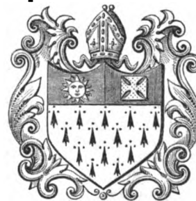
Arms of the Bishoprick.