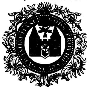
Arms of the Bishoprick.

LISMATEIGUE , a denomination or reputed parish, in the barony of KNOCKTOPHER , county of KILKENNY , and province of LEINSTER , 3 miles (S.) from Knocktopher, on the road from Waterford to Kilkenny; containing 931 inhabitants. It anciently formed part of the possessions of the Abbey of Jerpoint; and comprises 2637 statute acres, of which the tithes, amounting to £100, are payable to the rector and vicar of Burnchurch, in the diocese of Ossory.