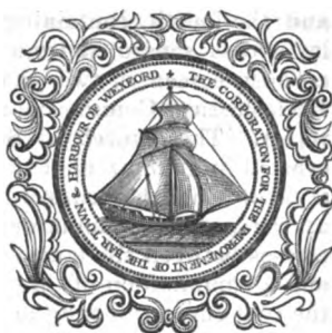
Harbour Corporation Seal.

The first charter to Wexford on record is that of Adomar de Valence in 1318, already noticed, which was confirmed and extended by that of the 12th of Hen. IV., in 1411, and again confirmed by Elizabeth in 1558. The act of the 28th of Hen. VIII. for vesting the estates of absentees in the crown, under which that of Talbot, Earl of Shrewsbury, was confiscated, was followed by another specially confirming the liberties