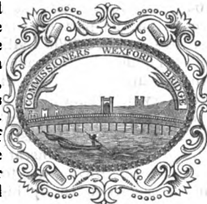
Bridge Commissioners' Seal.