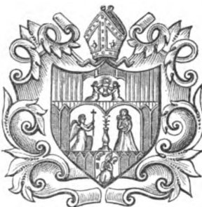
Arms of the Bishoprick.

plied to the payment of the perpetual cure and the repairs of the cathedral. There are four rural deaneries, namely, Leighlin, Carlow, Tullow, and Maryborough. The consistorial court of the diocese is held at Carlow, and consists of a vicar-general, three surrogates, a registrar, and two proctors. The total number of parishes is 80, comprised in 59 benefices, of which 14 are unions of two or more parishes, and 45 are single parishes; of these, 5 are in the patronage of the Crown, 10 in lay or corporation patronage, 9 in joint or alternate patronage, and the remainder are in the patronage of the Bishop or incumbents. The number of churches is 49, and there are four other episcopal places of worship; the number of glebe-houses is 25.